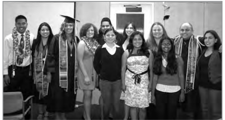
Spring 2008 labor and workplace studies minor graduates.