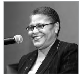
Speaker Karen Bass.