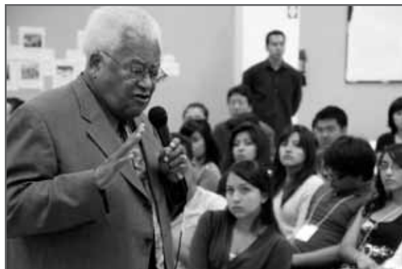
Rev. James Lawson Jr. speaks to Dream Summer interns

In June the UCLA Labor Center's Dream Resource Center (DRC) launched Dream Summer, a national internship program for Dream Act student leaders, in California, Miami, Washington, DC, Phoenix, and New York. This is the first program of its kind giving Dream Act student leaders the opportunity to improve their leadership skills within social-justice organizations. Over one hundred students were placed at various organizations for ten weeks to engage in research, education, and outreach activities.