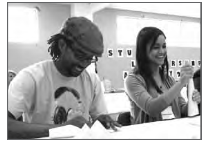
SLA orientation workshop

The Labor Center's third annual Student Leadership Academy (SLA) kicked off at the Downtown Labor Center in May. The SLA is a leadership development program that connects university students to career opportunities in labor and worker rights organizations. The program includes a leadership training followed by an eight-week, paid, full-time internship. The Labor Center received nearly two hundred applications from across the nation for the thirty-five internships. Trainers from UNITE HERE Local 11, CLUE, LAANE, and Pride at Work partnered with the Labor Center to present workshops. Students interned with SEIU ULTCW, UFCW, United Nurses Associations of California/Union of Health Care Professionals AFSCME, UFCW Local 770, Warehouse Workers United, the California Construction Academy, and the Directors Guild of America.