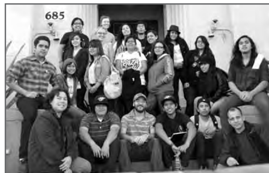
UCLA and MCLC students at SPARC